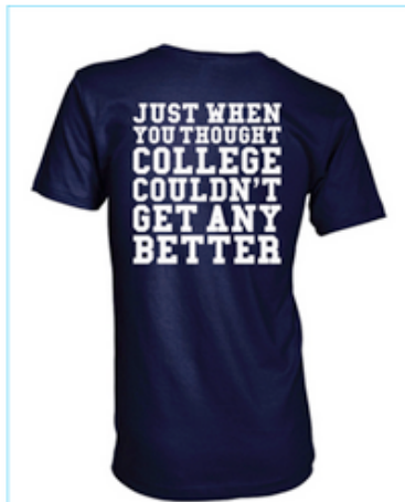
front Item Color: Navy